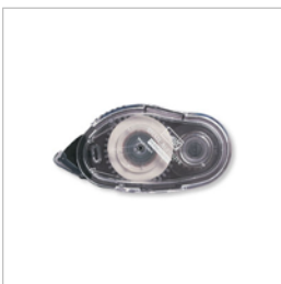
Snail Adhesive - 104332