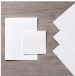
Whisper White 8-1/2" X 11" Thick Cardstock - 140272