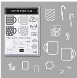
Cup Of Christmas Bundle (En) - 153025