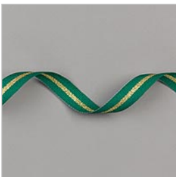
Shaded Spruce/Gold 3/8" (1 Cm) Striped Ribbon - 149597